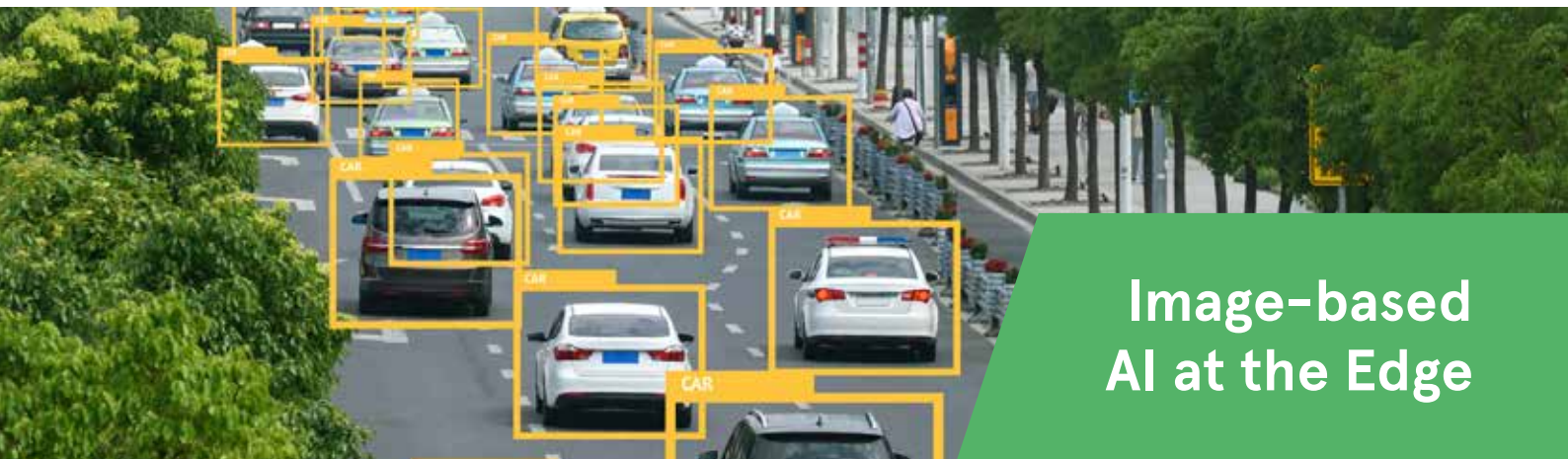
Image-based AI at the Edge