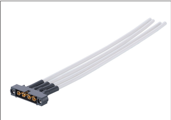
Datamate Power single ended male cable assembly