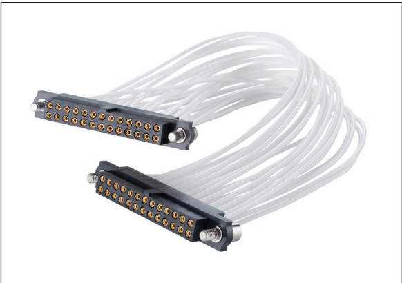
Datamate J-Tek double-ended female cable assembly