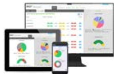
Digi Remote Manager® Comprehensive IoT Device Management Application for Secure Asset Monitoring and Control 30-Day Free Trial: https://myaccount.digi.com/