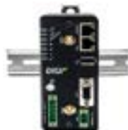
Digi WR31 Intelligent 4G LTE router designed for critical infrastructure applications