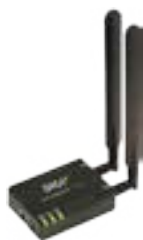
Digi WR11 3G/4G/LTE enterprise class cellular routers