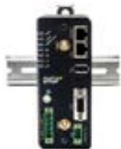
Digi WR31 Intelligent 4G LTE router designed for critical infrastructure applications