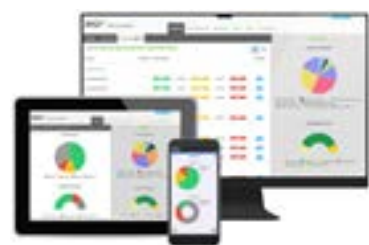
Digi Remote Manager® Comprehensive IoT Device Management Application for Secure Asset Monitoring and Control 30-Day Free Trial: https://myaccount.digi.com/