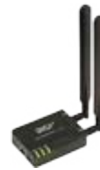
Digi WR11 Routers 3G/4G/LTE enterprise class cellular routers