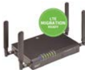
Digi LR54 Routers High speed LTE Advanced and Wi-Fi router.