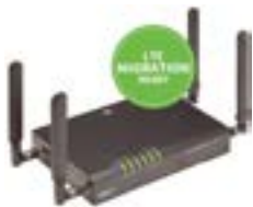
Digi LR54 High speed LTE Advanced and Wi-Fi router.