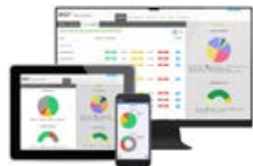
Digi Remote Manager® Comprehensive IoT Device Management Application for Secure Asset Monitoring and Control 30-Day Free Trial: https://myaccount.digi.com/