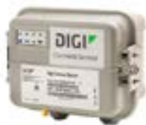
Digi ConnectSensor+ Easy-to-install and roll-out ready, battery-powered cellular gateway solution

INTEGRATE, MANAGE AND MONITOR REMOTELY DEPLOYED TANKS OF LIQUIDS, SOLIDS AND GASES WITH NEXT GENERATION TANK LEVEL TELEMETRY AND MANAGEMENT SOLUTIONS