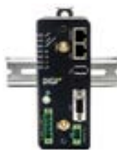
Digi WR31 Intelligent 4G LTE router designed for critical infrastructure applications