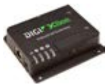
Digi XBee® Industrial Gateway Programmable gateway connects Digi XBee enabled devices to remote applications over Cellular or Ethernet