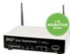
Digi WR44-RR 3G/4G/LTE enterprise class cellular routers.